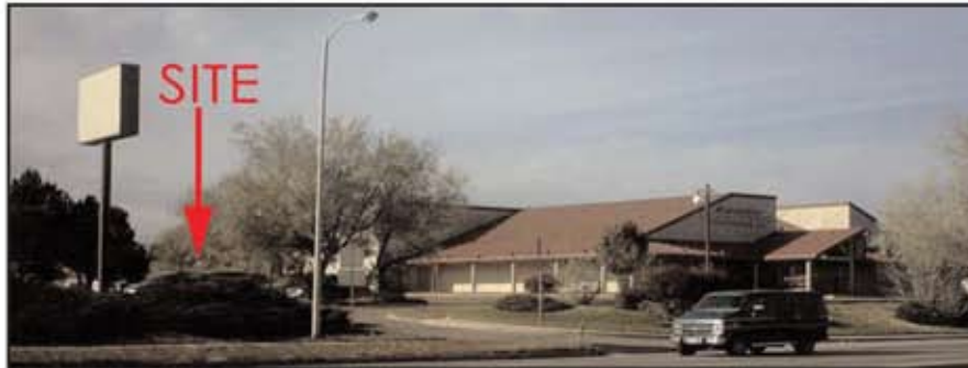
High visibility signage available. 20' lighted sign already in.

South of Austin Bluffs Parkway - Behind the Copperhead Road Restaurant (Formerly Black Angus)